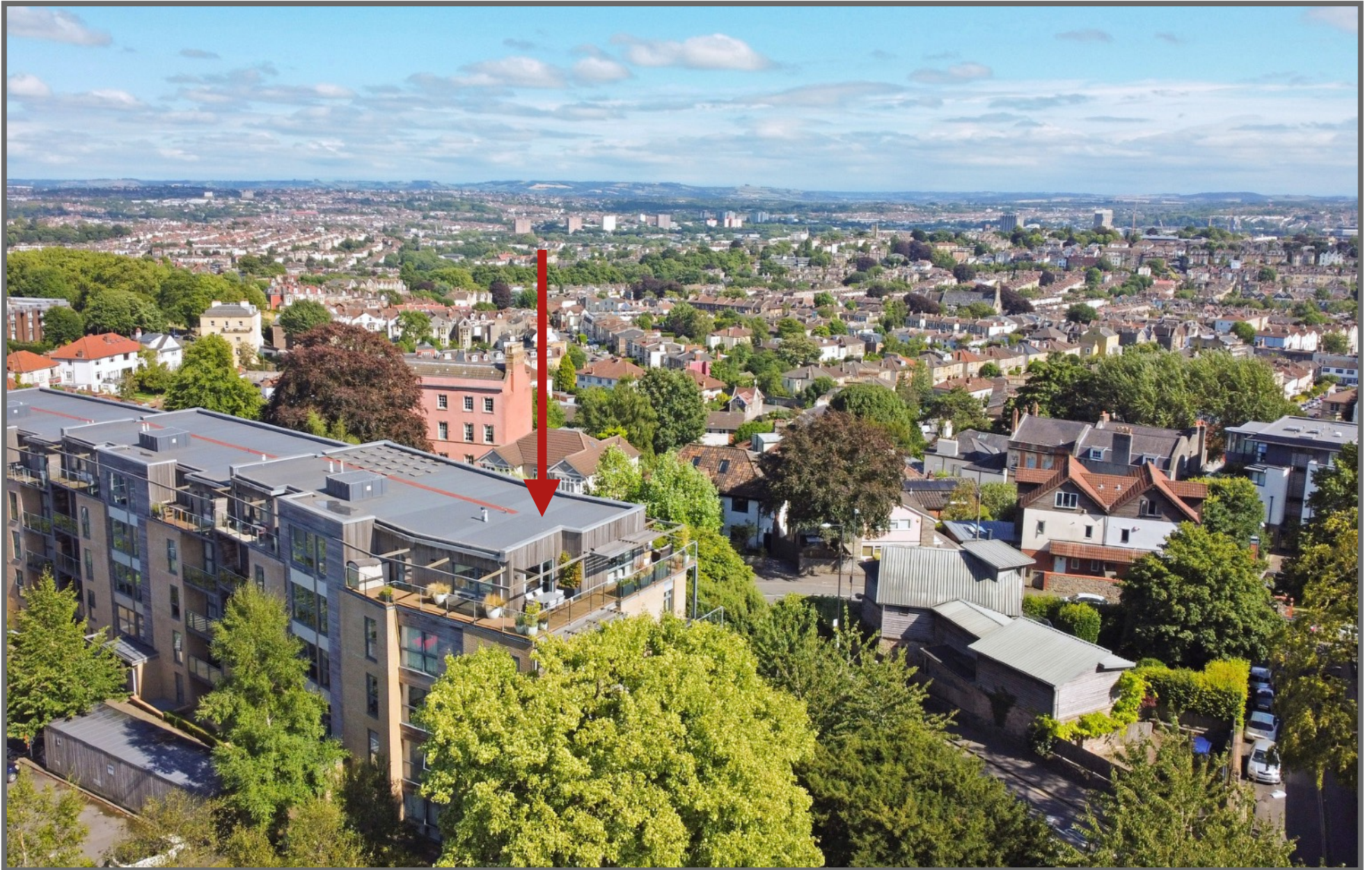
35 THE PRAEDIUM, CHAPTER WALK, REDLAND, BRISTOL, BS6 6WB